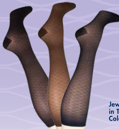
Jewel Knee-high in Three Stylish Colors

Want to add a little sparkle to your support hosiery offering? Talk to your SIGVARIS representative to find out more about Jewel, or visit www.sigvarisusa.com for more details.