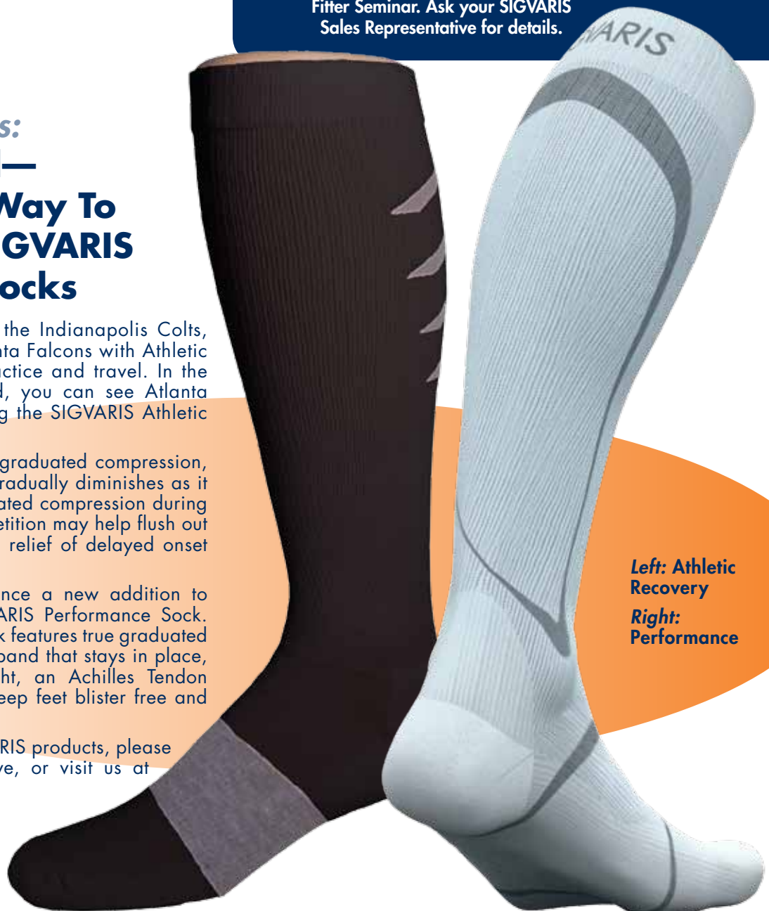
Left: Athletic Recovery Right: Performance

For more information about all SIGVARIS products, please contact your SIGVARIS representative, or visit us at www.sigvarisusa.com .