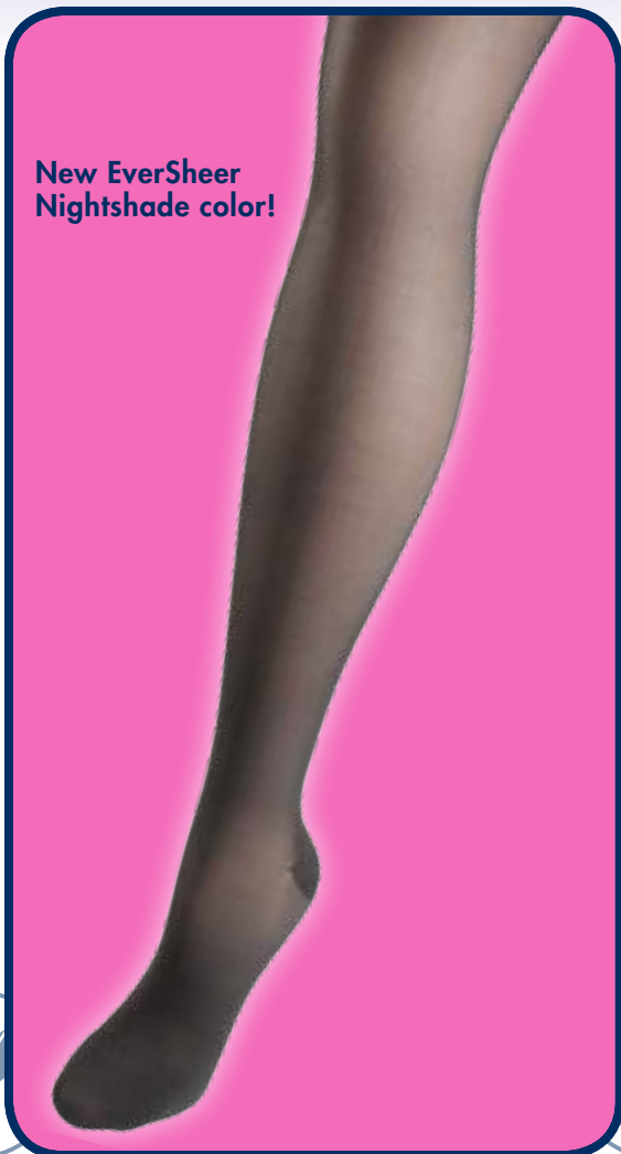
New EverSheer Nightshade color!