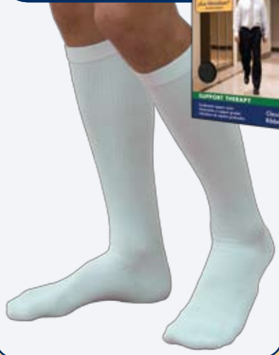
180 Classic Ribbed