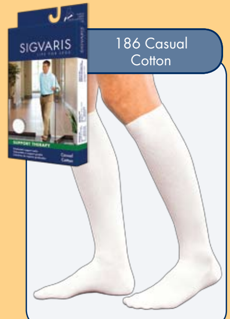
186 Casual Cotton

– Meryl Zelenak, Rotary Drug, Stratford, CT