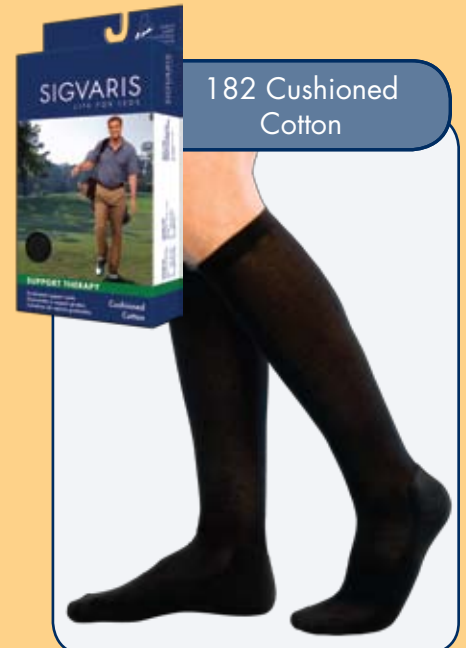
182 Cushioned Cotton