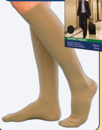
185 Classic Dress

Reinforced heel and comfortable toe zone